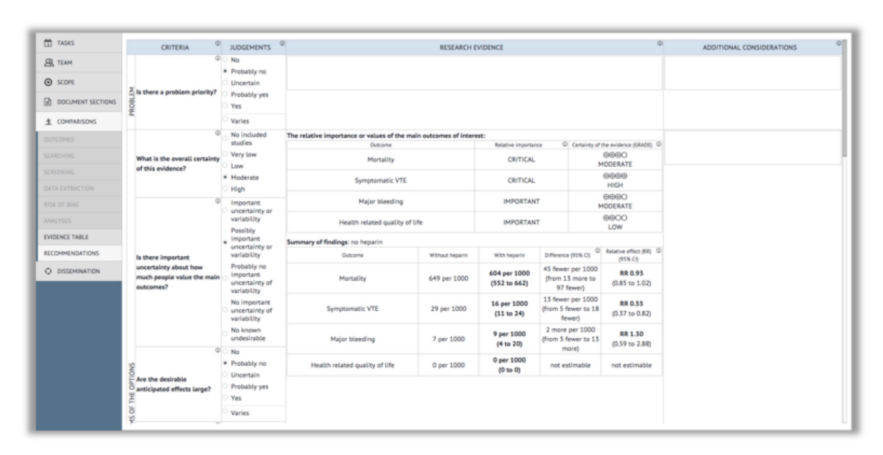
Figure 3: The Evidence to Decision framework within the GRADEproGDT.